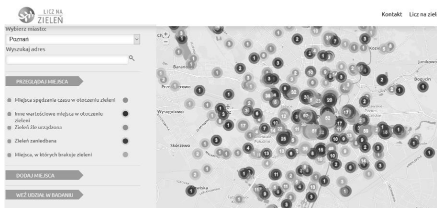
Figure 2. The website of “Count on green” project.

sed in several large Polish cities, is an example of such an initiative. The city inhabitants had the chance to put their remarks (both positive and negative), regarding green areas, on the maps. Figure 2 presents a map generated for Poznań. Although Figure 2 is black and white, the online version of the map is in colour. Numbers in circles stand for the number of opinions given about a certain place.