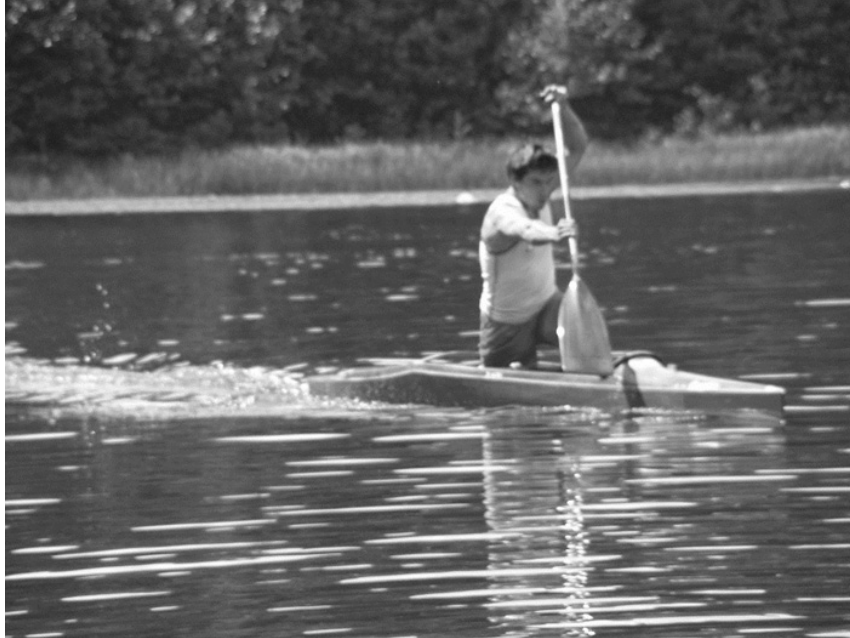
Figure 1. A competitor while paddling a canoe.